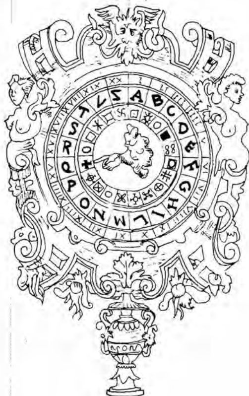
One of Giovanni Battista Porta's Cipher Disks